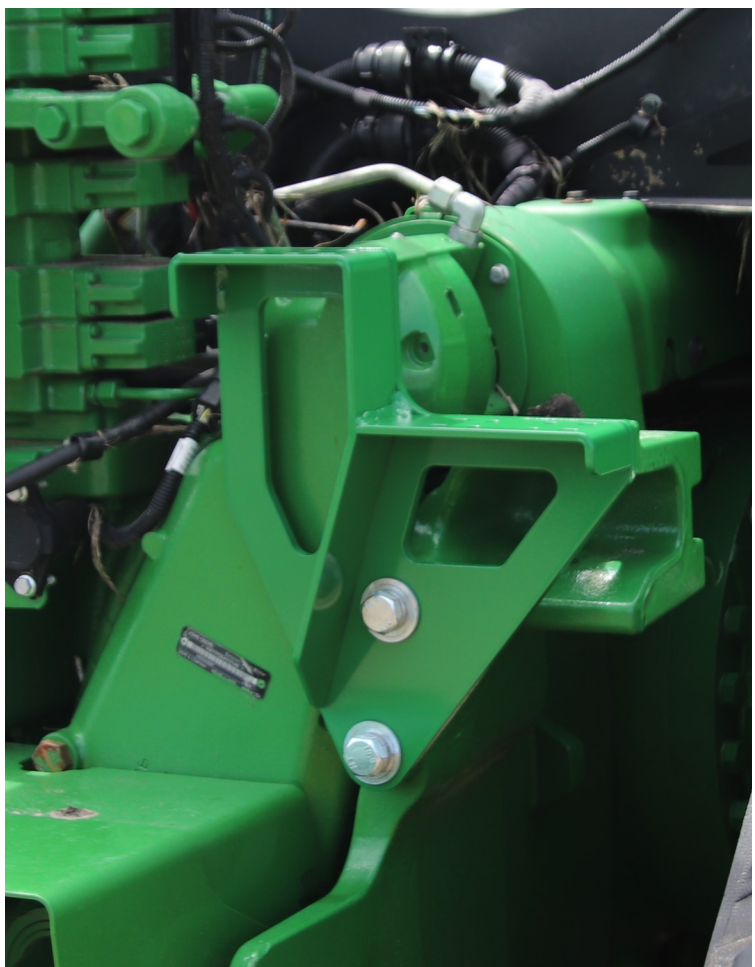
For further technical assistance,

Follow the additional instructions provided to install blocks and route hoses/fittings correctly.