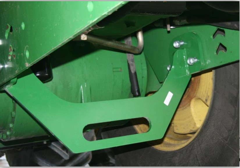
Company. ta Group.