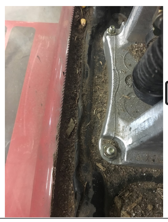
Figure 2 Figure 3