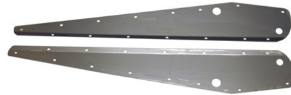
LANPSP604L & LANPSP604R