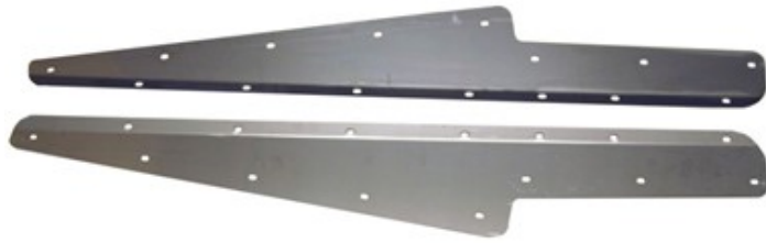
LANPSP601L & LANPSP601R