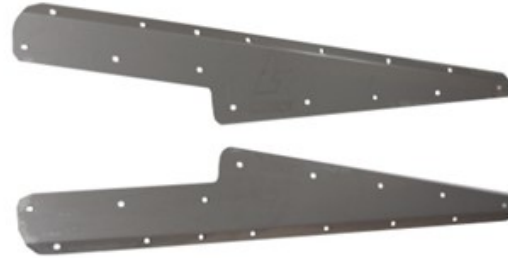
LANPSP602L & LANPSP602R